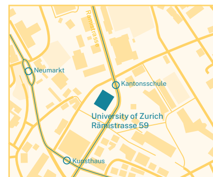
Bus 31 or tram 3 from Bahnhofplatz/HB to Kunsthaus, then walk up to Rämistrasse 59.